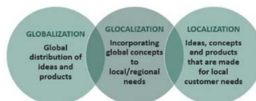
Figure 1. Meaning of glocalization [15].

Modern design develops in the conditions of the spread of globalization processes, which eliminate individual, ethnic, and national characteristics, directing human needs to universal, uniform, sometimes impersonal standards. In these circumstances, ethnodesign is perceived as one of the vectors of