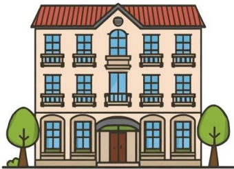
An Expensive Hotel