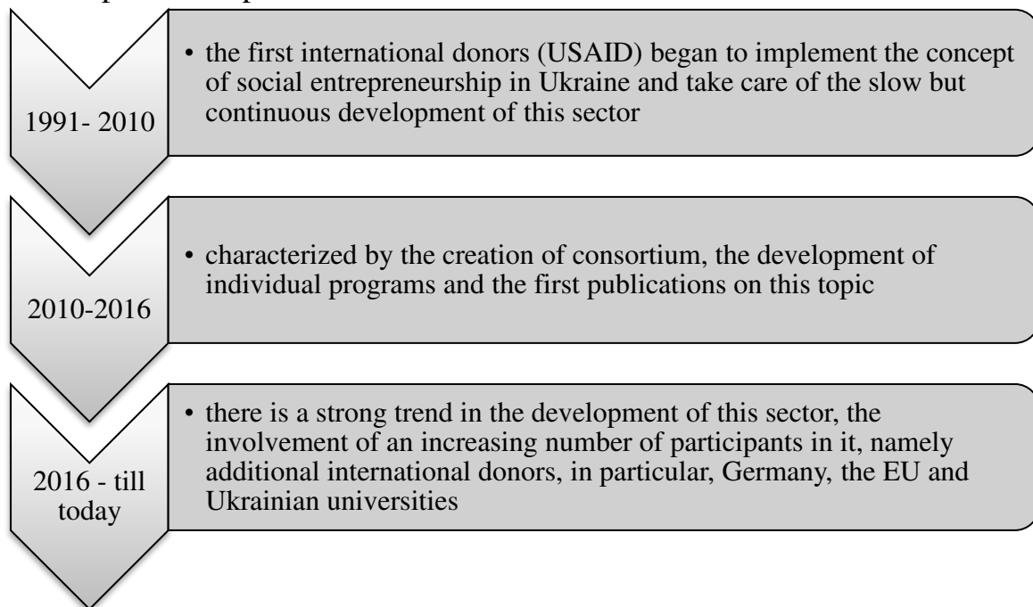
Figure 1. Evolution of development of PPP social entrepreneurship in Ukraine

phase of development, which began in 2010, was notable for the formation of consortia and the first substantial research and publications on the topic of social entrepreneurship. Since 2016, the third stage of the rapid development of social entrepreneurship began, which was distinguished by a greater number of involved participants from the public sector for the implementation of projects in the field of social entrepreneurship.